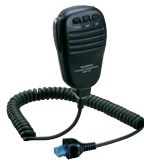
MH-31A8J*1 Hand Microphone