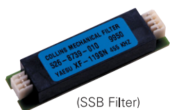
(SSB Filter) • YF-122S (2.3kHz)

A slot is provided inside the FT-818ND to permit installation of a 2.3kHz, 500Hz or 300Hz optional Collins® Mechanical Filter. The chosen filter will enhance receiver performance.