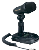
M-1 Reference Microphone