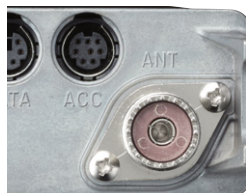
Rear Panel (M type)