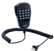
MH-36E8J DTMF Microphone