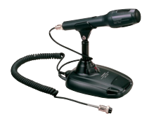
MD-100A8X Desktop Microphone