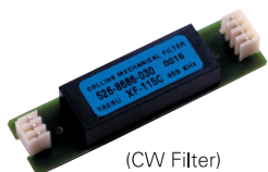
(CW Filter) • YF-122C (500Hz) • YF-122CN (300Hz)