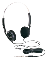
YH-77STA Lightweight Stereo Headphone