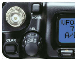
Front Panel (BNC)

The FT-818ND is equipped two antenna connectors, a BNC-type on the front panel and an M-type on the rear panel. For portable and field operation the supplied whip antenna may be connected to the BNC connector. The Menu system allows setting which antenna connector will be selected for the operating bands.