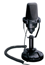
MD-200A8X Ultra High fidelity Desktop Microphone